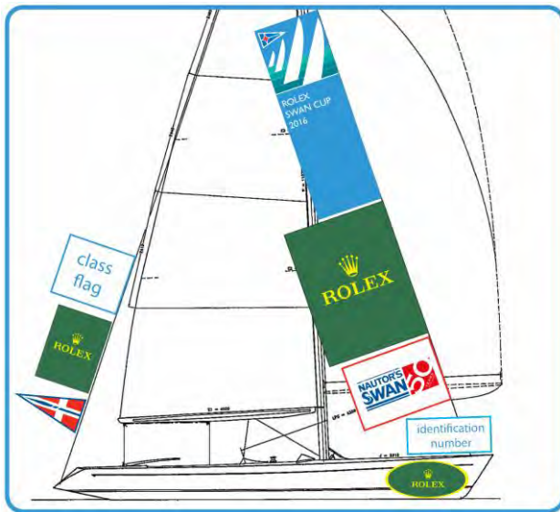
CLASS: A, A1, B &amp; C