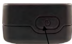
Switch On/Off Button