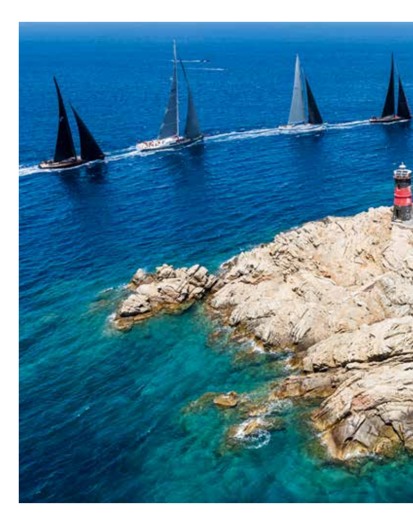
14.4 Yachts equipped with Automatic Identification System (AIS) are required to operate their AIS system from the time they approach the starting area until departing the finishing area following the race.

14.3 ▶ Boat to boat communication is allowed and encouraged to allow the safest possible navigation during the regatta and one dedicated VHF channel will be used for this purpose.