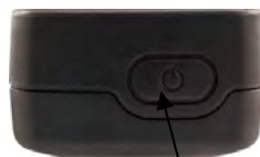
Switch On/Off Button