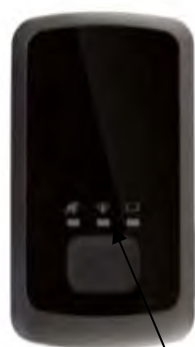
Led Indicators GPS GSM Power