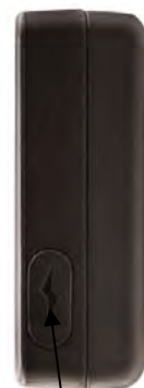
Mini USB Connector