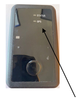
Led Indicators GPS GSM Power