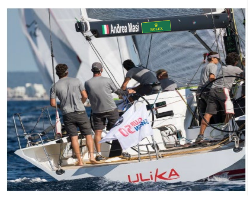
ROLEX STICKER: has to be placed ahead to the NAME+FLAG (10 cm after)

SEE BELOW THE PROPER BOOM STICKER POSITON (the back part of the sticker has to be as close to the boom end as possible on both sides)