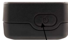
Switch On/Off Button