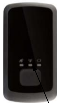
Led Indicators GPS GSM Power