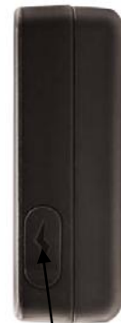
Mini USB Connector