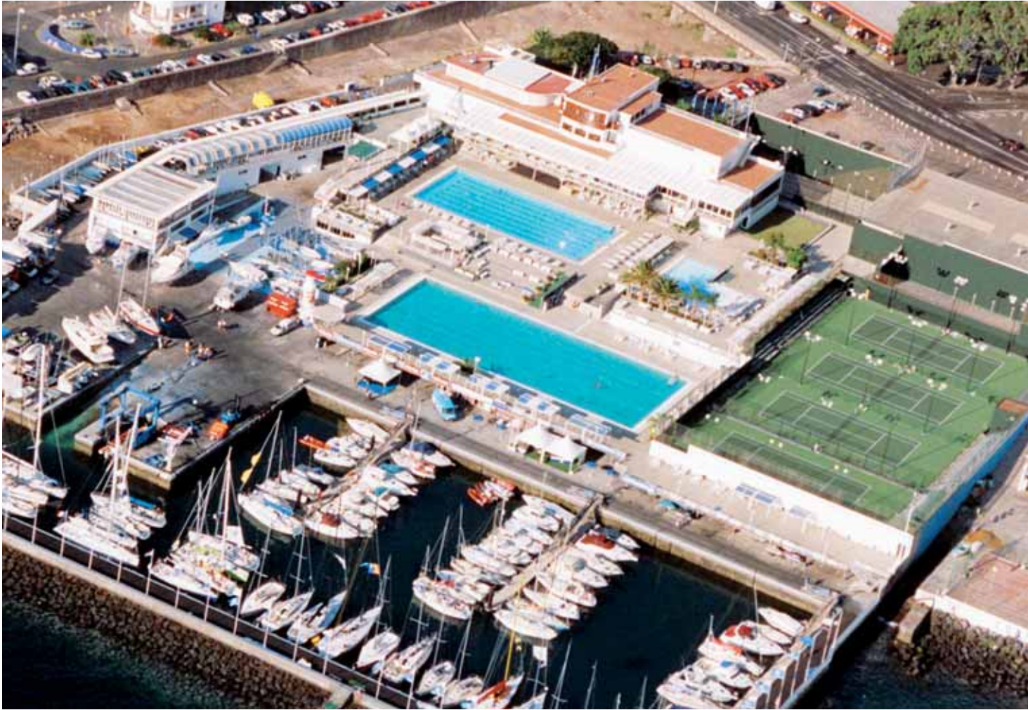
Real Club Nautico de Tenerife